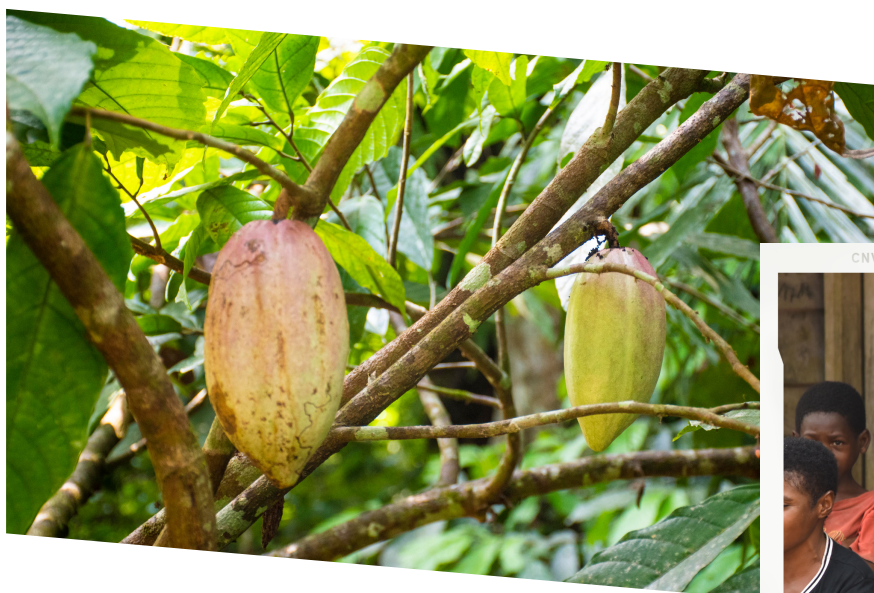
The women of Nyamabandé, beneficiaries of the project

The funding granted will make it possible to establish 16 ha of cocoa-based agroforestry enriched with local fruit trees, to ensure the commercialization of products from the plantations, to organize the communities into cooperatives and to set up a hundred beehives to limit human-elephant conflicts in the Campo-Ma'an National Park area.