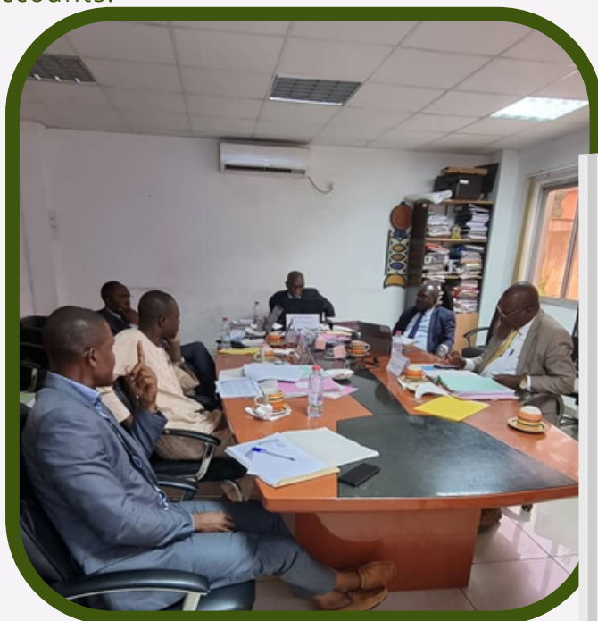
View of the work of the 47th session of the FEDEC Board of Directors

The Administrative Office of the Foundation was also congratulated for the good quality of the documents presented, the financial management as well as the keeping of the accounts.