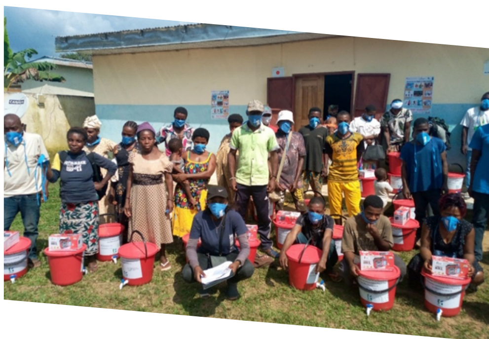
Distribution of tap buckets and nose covers

A training session on the manufacture of soap and hydro-alcoholic gel was organized. More than 300 soaps and 150 bottles of hydroalcoholic gel were produced at the end of this training, which represents for most of the women a big step towards financial autonomy.