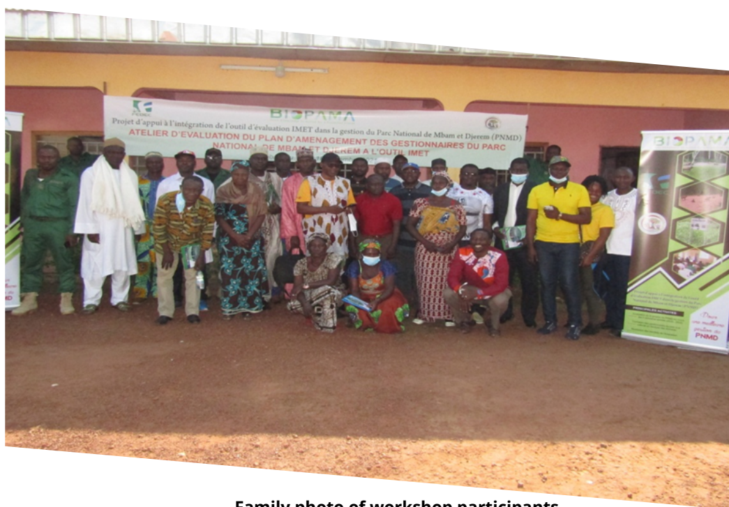
Family photo of workshop participants

FEDEC received a grant from BIOPAMA for the implementation of the project "Support for the integration of the IMET (Integrated Management Effectiveness Tool) evaluation tool in the management of the Mbam-Djerem National Park (MDNP)". The main objective of this project, which will run from September 1, 2021 to January 31, 2022, is to provide support for the evaluation of MDNP activities during the period from 2016 to 2020. This evaluation will allow for the identification of priorities for results-based actions and an analysis of the environmental and social risks present in the area. At the end of the project, an evaluation report on the management of the MDNP as well as a precise and realistic priority action plan will be published and will serve as a guide for better management of the park.